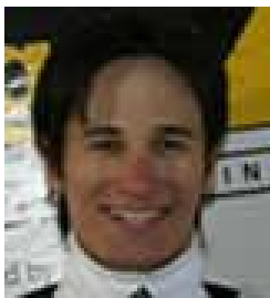
Martin Schmitt